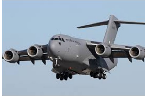
C-17 Globemaster III

The massive U.S. Air Force C-17 Globemaster III will fly a demo flight at this year's show. It will be accompanied by the big KC-135 Stratotanker that will do a demo as well. The aircraft will perform separate demos and then join up for some formation flying. Spectators will be able to tour the aircraft and speak with flight crews. A great addition to the 2019 show!